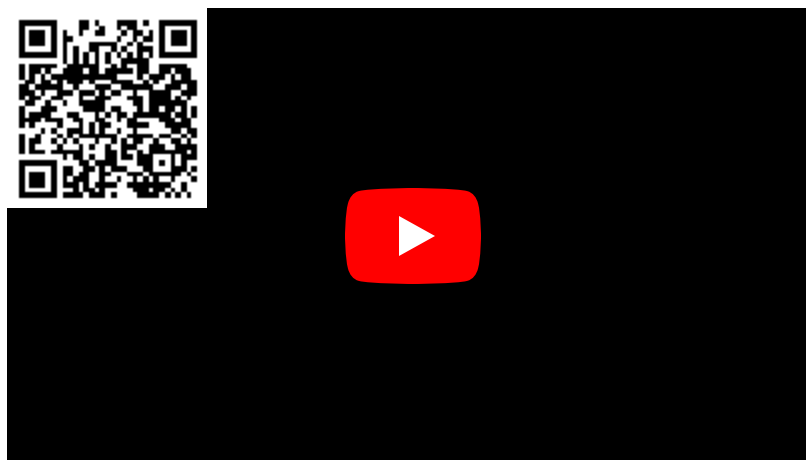
Video 4.2.1: A Boy And His Atom: The World's Smallest Movie.

A Boy and His Atom is a 2012 stop-motion animated short film released by IBM Research. The movie tells the story of a boy and a wayward atom who meet and become friends. It depicts a boy playing with an atom that takes various forms. It was made by moving carbon monoxide molecules viewed with a scanning tunneling microscope, a device that magnifies them 100 million times. These molecules were moved to create images, which were then saved as individual frames to make the film.