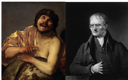
Figure 4.2.1: (left) Democritus by Hendrick ter Brugghen, 1628. Democritus was known as the "laughing philosopher." It was a good thing he liked to laugh, because most other philosophers were laughing at his theories. (right) British physicist and chemist John Dalton (1766-1844). Unlike the Greek philosophers, John Dalton believed in both logical thinking and experimentation.

About 2,500 years ago, early Greek philosophers believed the entire universe was a single, huge, entity. In other words, "everything was one." They believed that all objects, all matter, and all substances were connected as a single, big, unchangeable "thing." One of the first people to propose "atoms" was a man known as Democritus. As an alternative to the beliefs of the Greek philosophers, he suggested that atomos , or atomon—tiny, indivisible, solid objects—make up all matter in the universe.